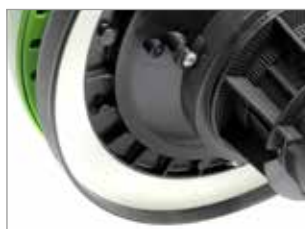
INNOVATIVE HEAD GASKET