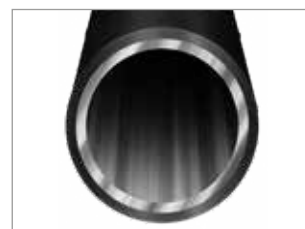
AP TUBES ARE LIGHTWEIGHT AND EXTREMELY ROBUST