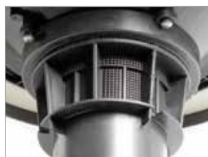
INTEGRATED ANTI-FOAM SYSTEM