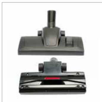
New powerful nozzle for high cleaning efficacy