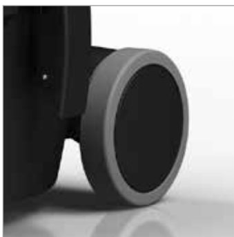
Wheels with rubber cover