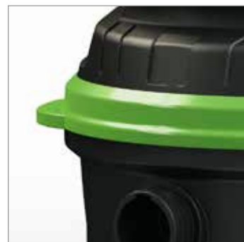
Side protection against doors and walls