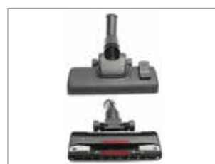
NEW POWERFUL NOZZLE FOR HIGH CLEANING EFFICACY