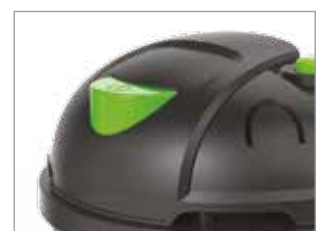
ON/OFF SWITCH OPERATED BY FOOT